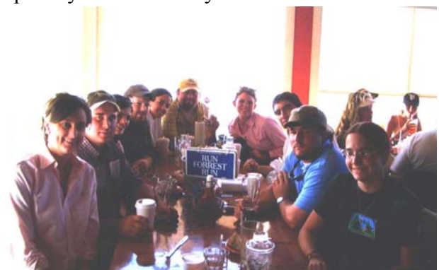
Agronomy Club at Bubba-Gump Restaurant at Fisherman’s Wharf in San Francisco, CA